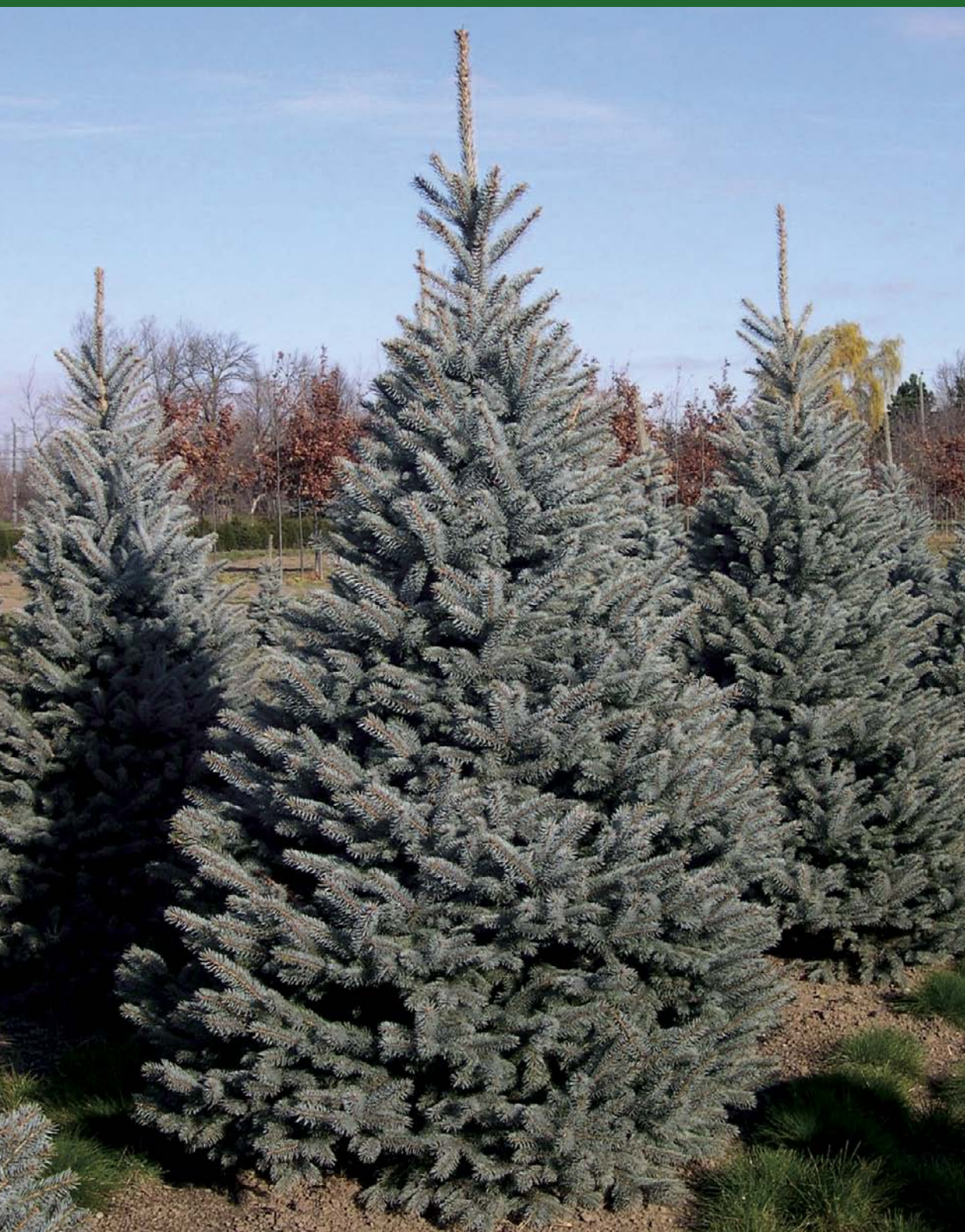
Fat Albert Spruce