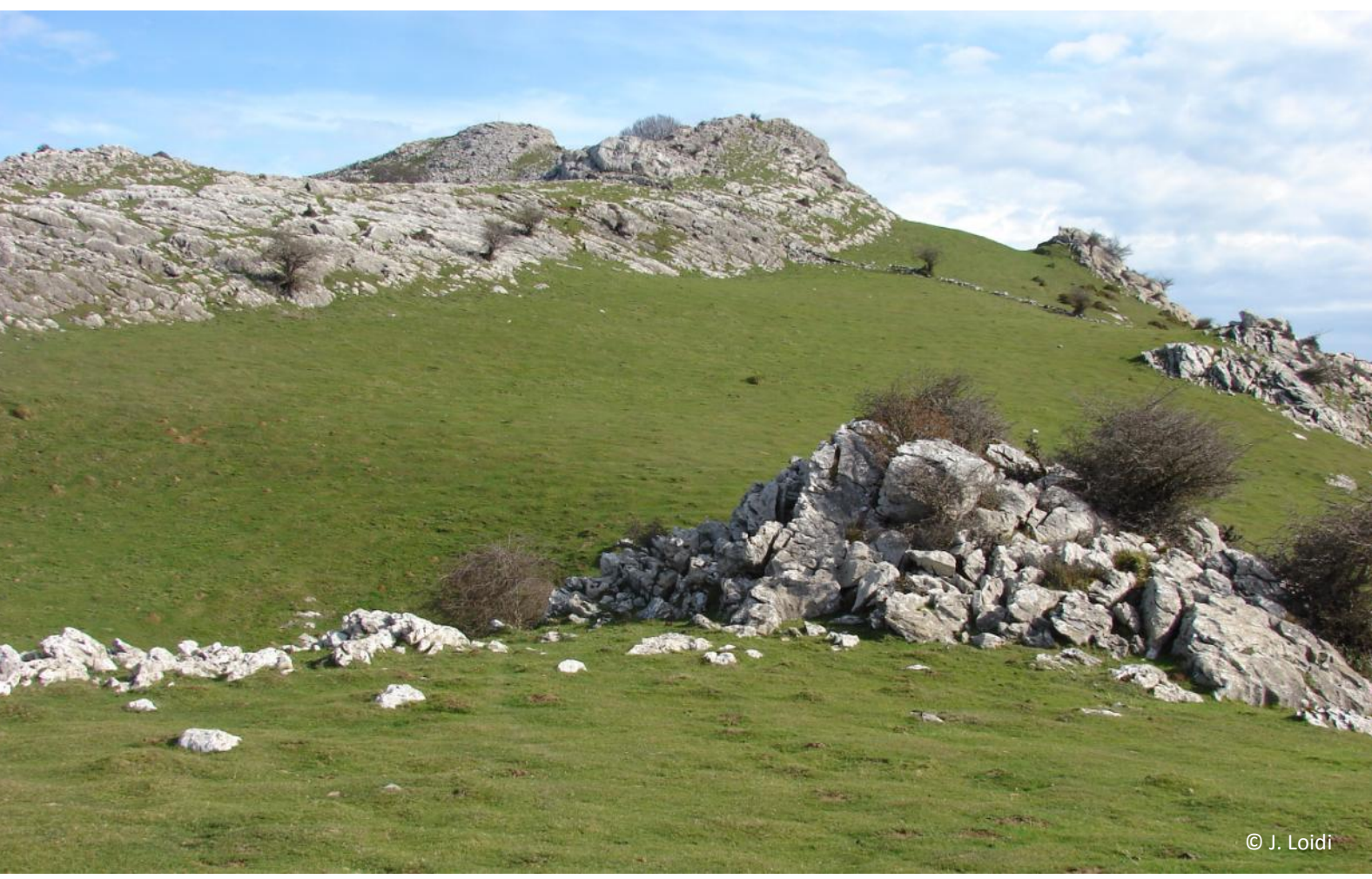
Beautiful montane grasslands in the Basque country – Javier's home.