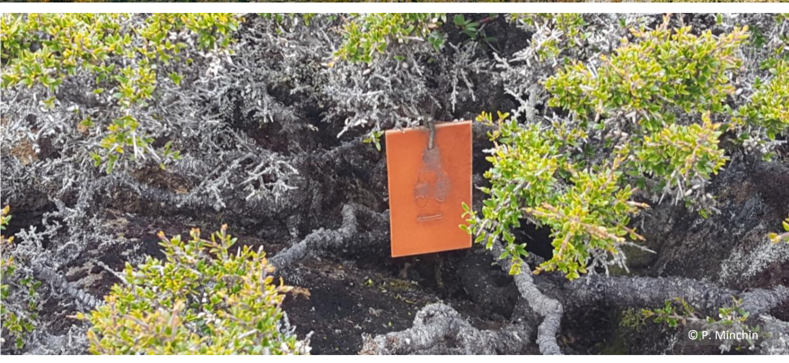
Mt. Field National Park in Tasmania.