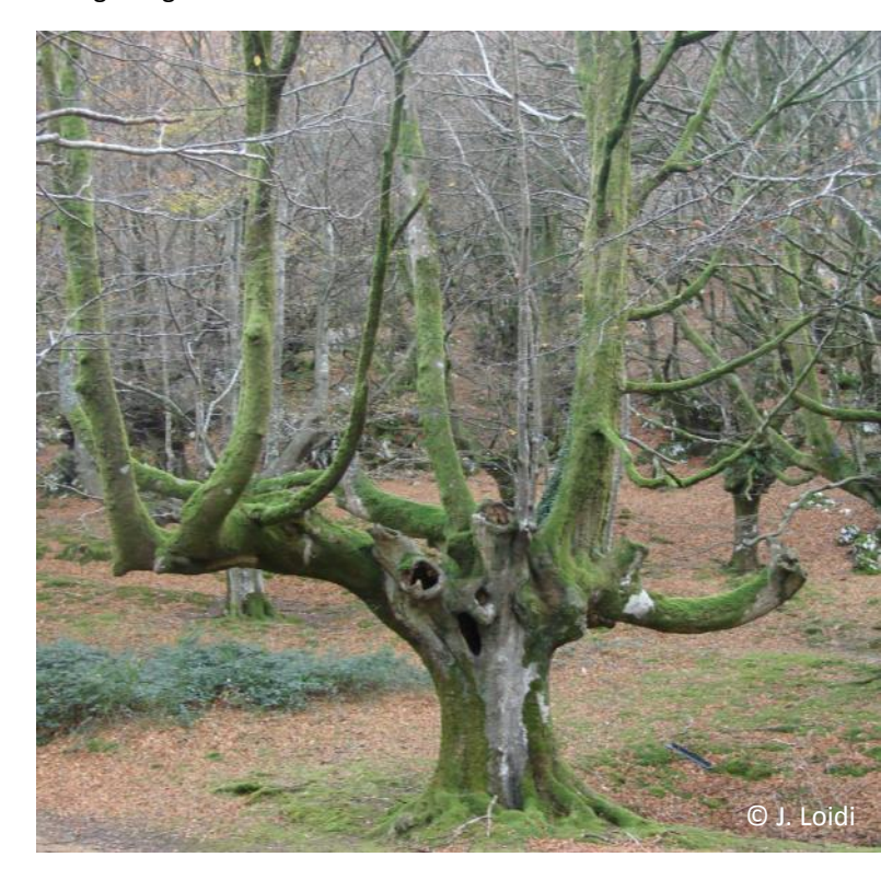
Pruned beech (Fagus sylvatica) in the Cantabrian Mts.

For all this, I consider myself a privileged person for being a vegetation scientist.