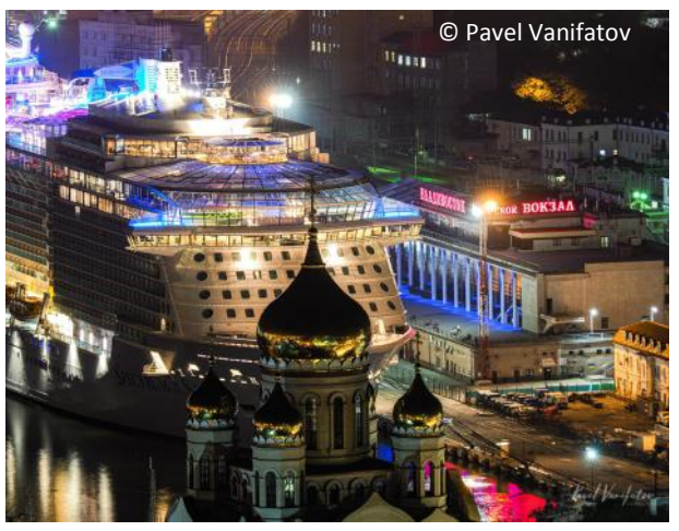
Golden Horn Bay of Vladivostok.