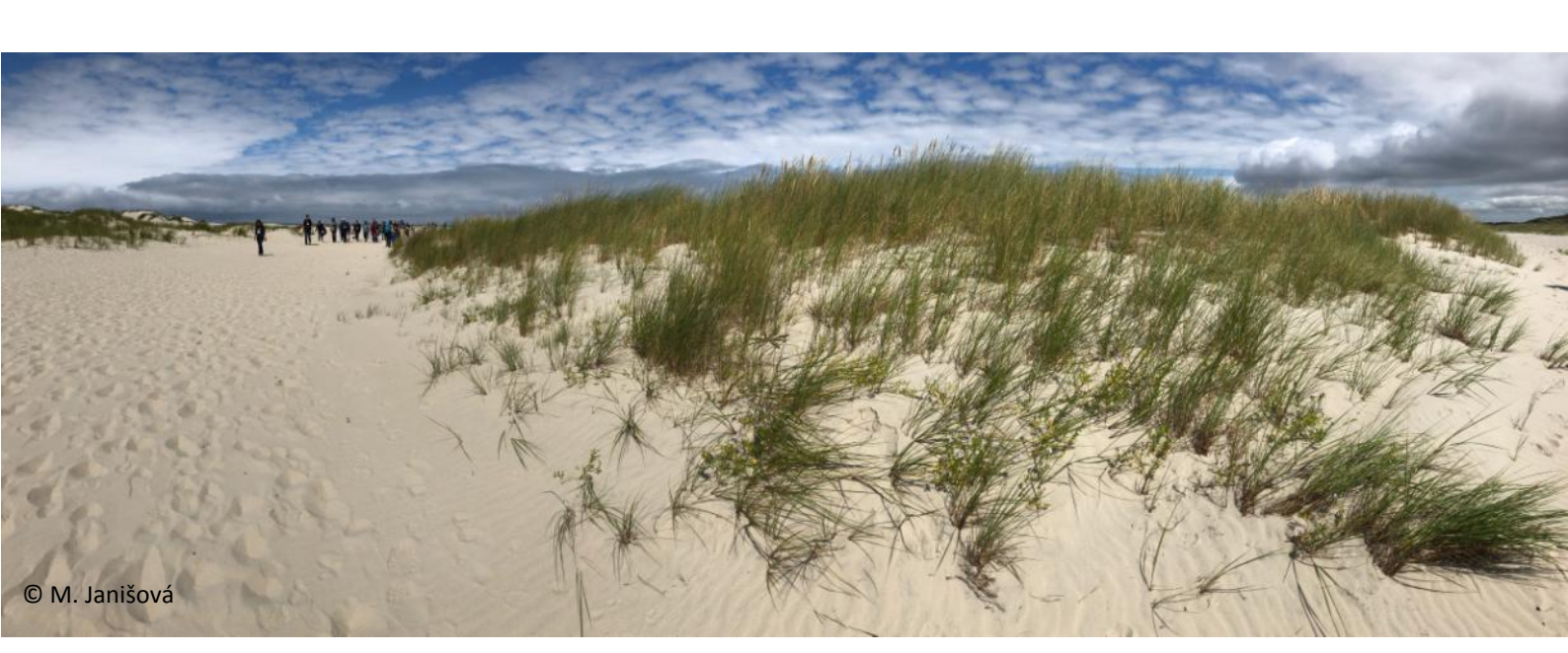
Sand dunes with Ammophila arenaria on the Spiekeroog island.

In 2018, average days from receipt of a final manuscript to print publication dropped by 2 days for JVS and increased by 19 days for AVS, compared to 2017 values. With the move in March 2019 of the Editorial Office for JVS and AVS from the outsourced company Editorial Office Ltd. to in-house production in Wiley, we anticipate that increased efficiencies will lead to drops in handling and production time for our journals. Under the new arrangements, Wiley has committed to maintain the average number of days between the receipt of final versions of accepted papers at Wiley to Early View publication at 27-30 days, which is about half the current time.