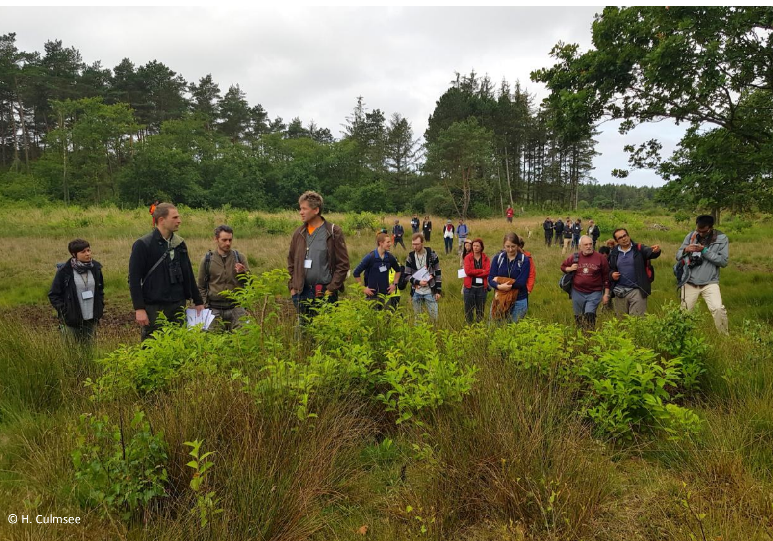
Mid-Symposium excursion 2019 to the Cuxhaven coastal heathlands.