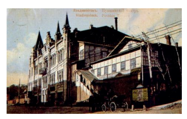
... and soon after its building