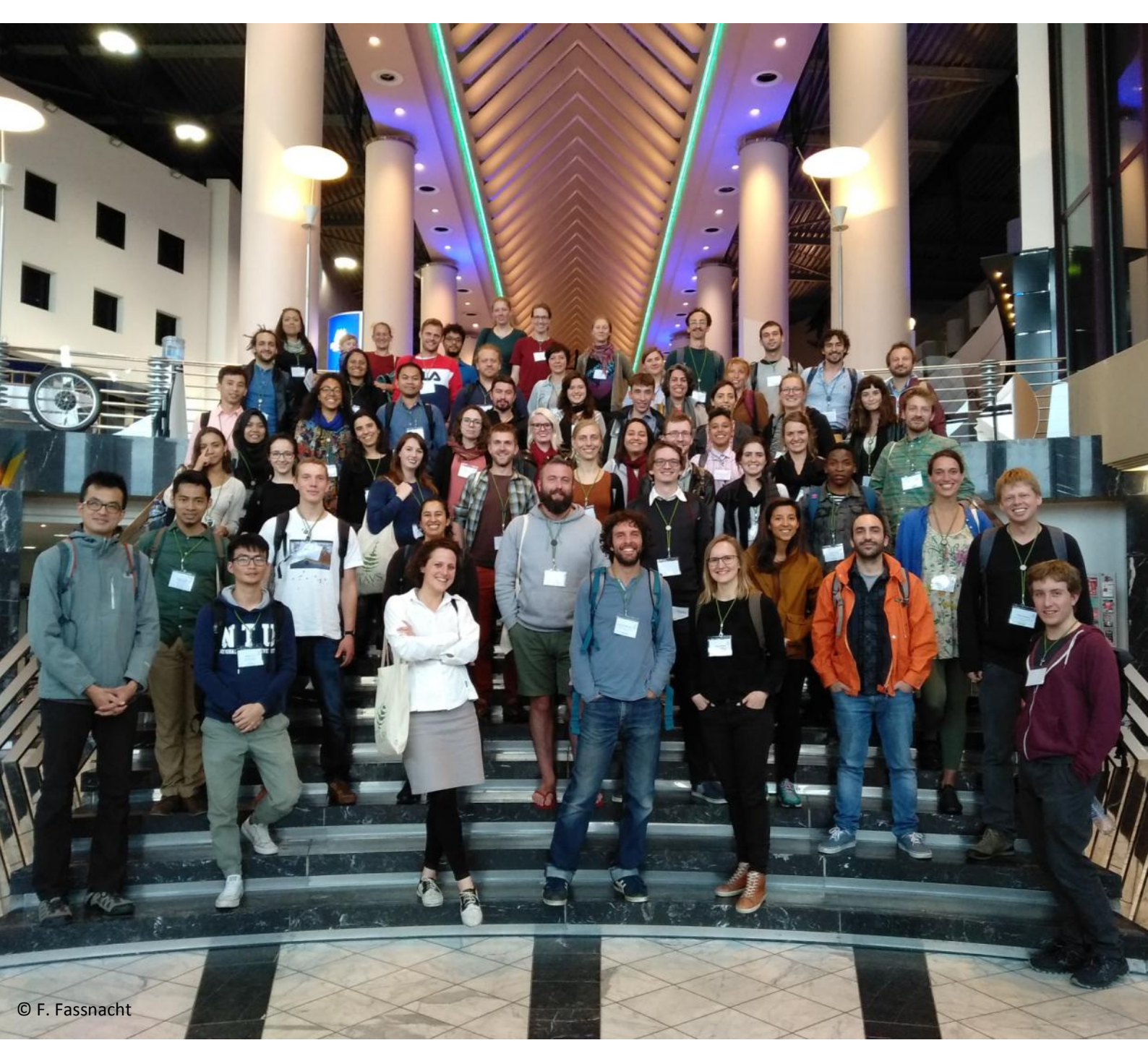
Young scientists working group in Bremen, Germany, July 2019.