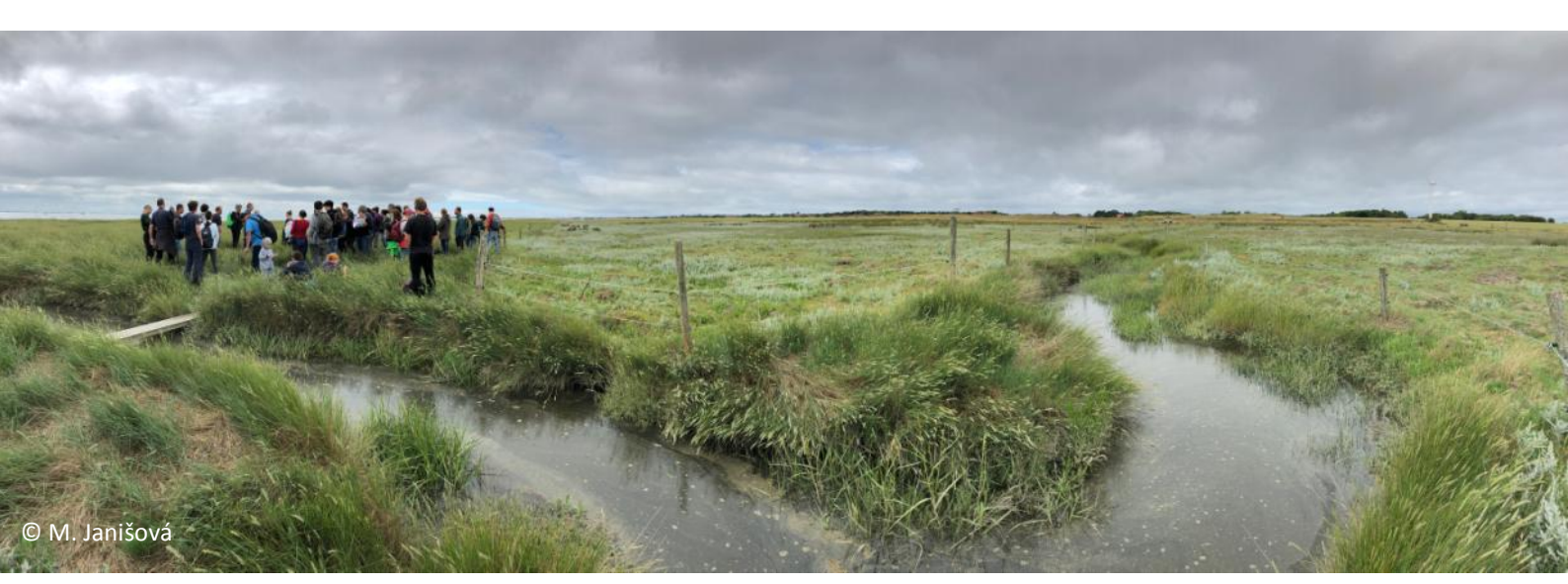
Mid-Symposium excursion 2019 to the island of Spiekeroog.