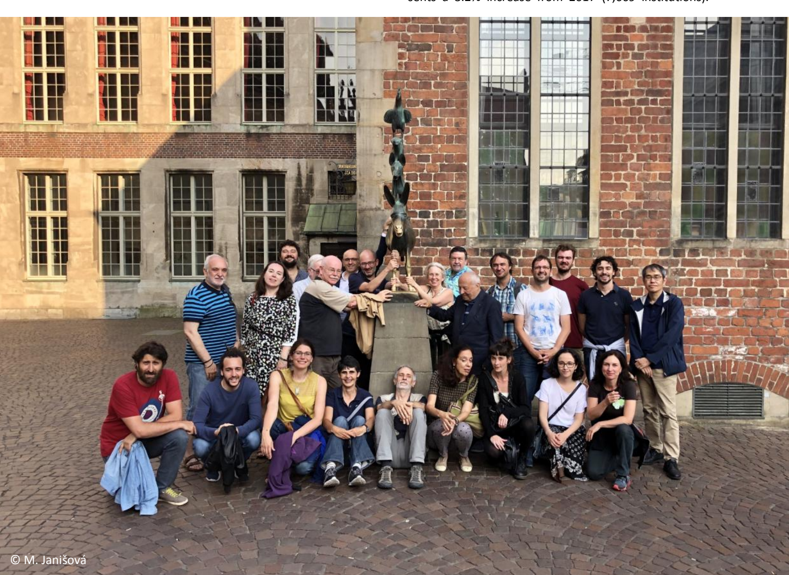
IAVS Symposium 2019 participants near the symbol of the city of Bremen - Bremen Musicians.

In 2018, Wiley's philanthropic initiatives gave low-cost or free access to current content in JVS and AVS to 7,911 institutions in developing countries. This represents a 3.2% increase from 2017 (7,669 institutions).