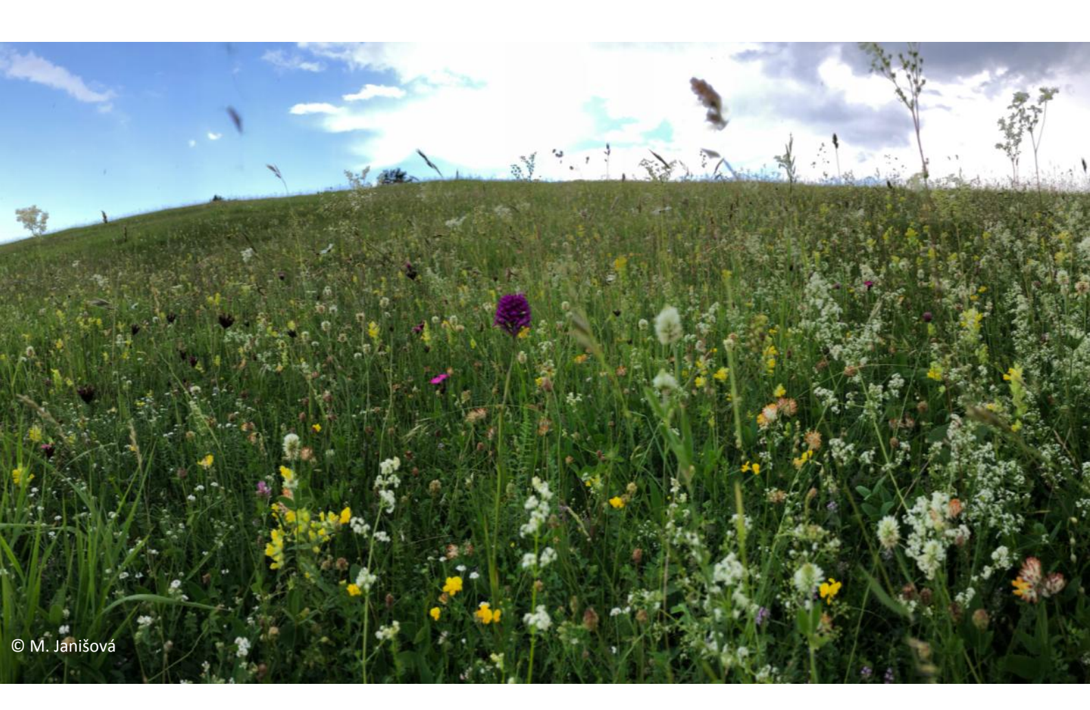
Grazed and manured meadows in Romanian Apuseni Carpathians are rich in species including orchids, such as Anacamptis pyramidalis.

Most of the inspiration comes directly from the vegetation and the vegetation scientists: when I look at them, I immediately have a bunch of questions. Fortunately, I usually find someone to answer \odot .