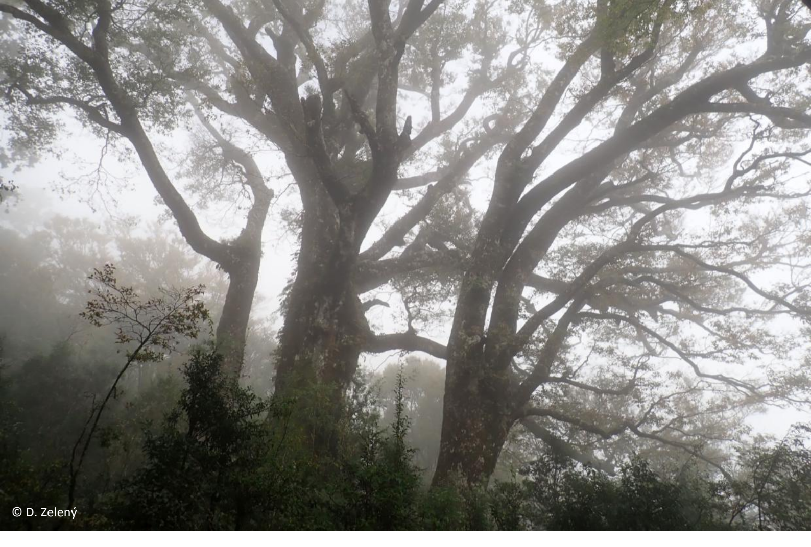
Taiwan's cloud forest dominated by Fagus hayatae (Lalashan, 2017, above) and Chamaecyparis obtusa var. formosana , covered by epiphytes (Smangus, 2009, below).