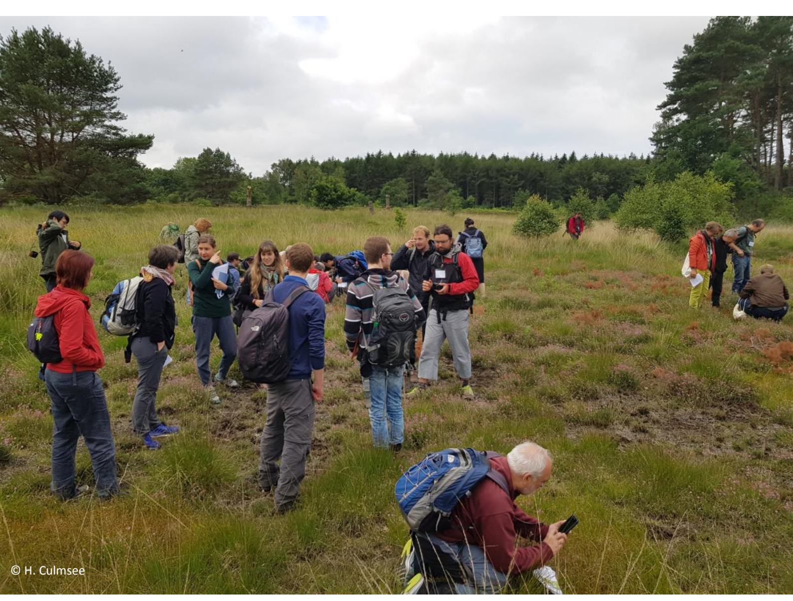
Mid-Symposium excursion 2019 to the Cuxhaven coastal heathlands.