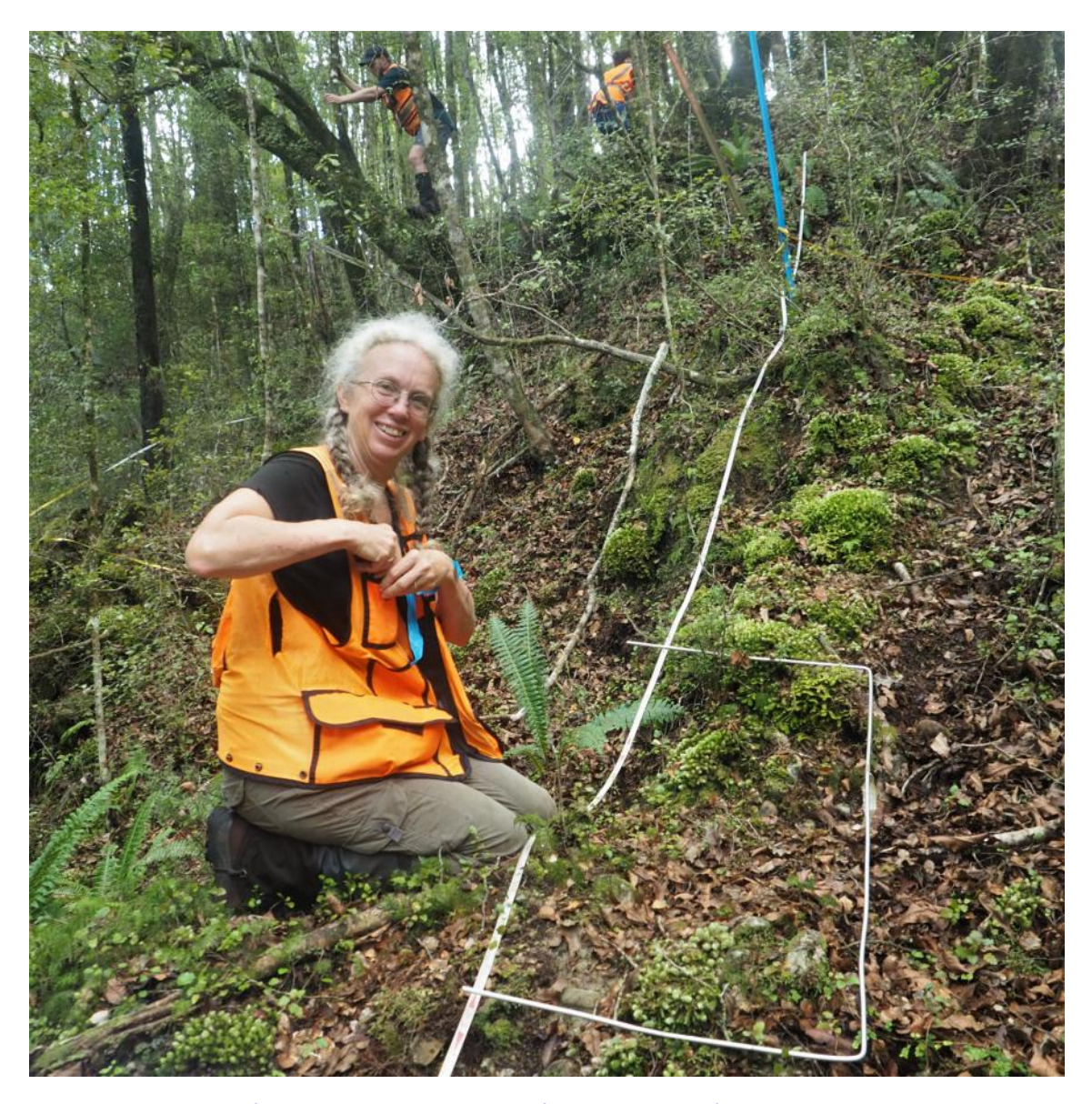
Long-term studies of disturbance and dynamics of southern beech forests, Grey Valley, New Zealand.

zone. I love the aesthetic of the open, low vegetation, the abundance of endemics and other rare species, the relatively low levels of weed invasion and the geomorphological setting. I suppose I'm also partial to them because these communities were the primary study sites for my PhD, so they feel like old friends.