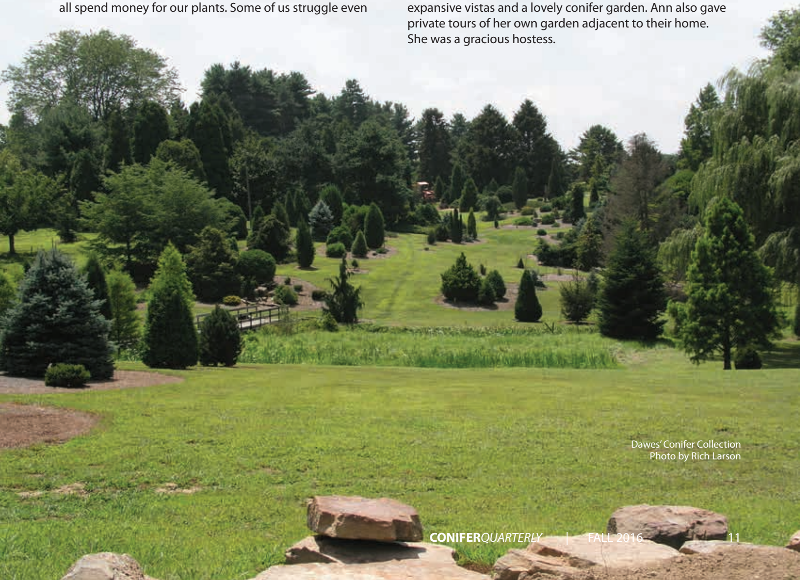
Dawes' Conifer Collection