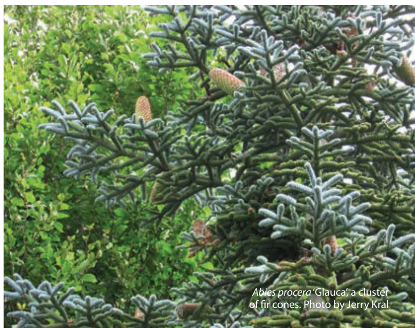
Abies procera 'Glauca', a cluster of fir cones.