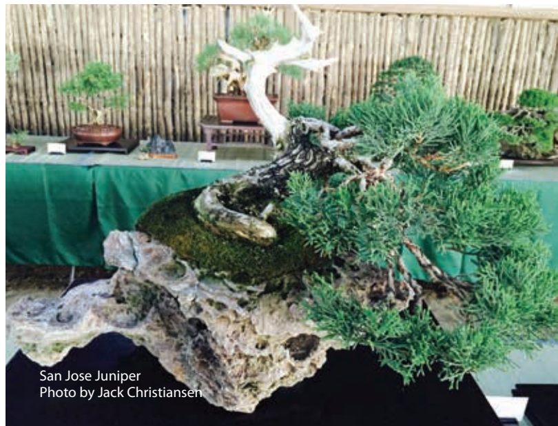
San Jose Juniper

The variety of tree species grown as bonsai and the many styling possibilities seem almost endless. Thus, this is not a pursuit one masters quickly and quickly feels a need to move on to other challenges.