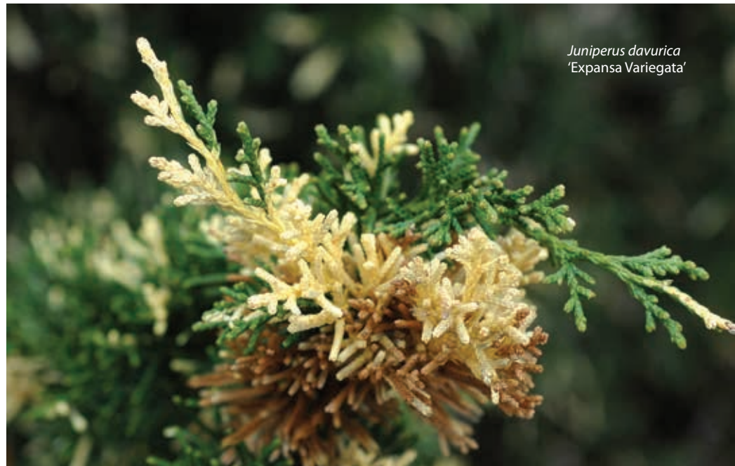
Juniperus davurica 'Expansa Variegata'

Last Spring, I bought Platycladus orientalis simply because it looked like a box of spaghetti growing out of a small pot. The plant must love its spot, as it has doubled in size over the past year. Since it was mixed with other dwarf-sized plants at the nursery, I didn't think too much about future growth when I bought it and stuck it in the ground.