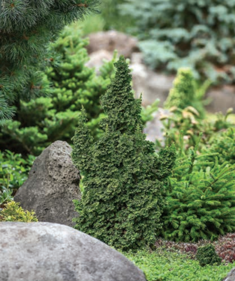
Thuja occidentalis Primo™ 'Isilprim'.