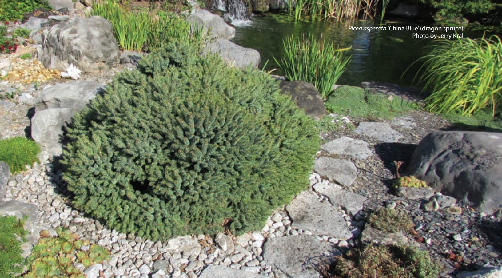
Picea asperata 'China Blue' (dragon spruce).