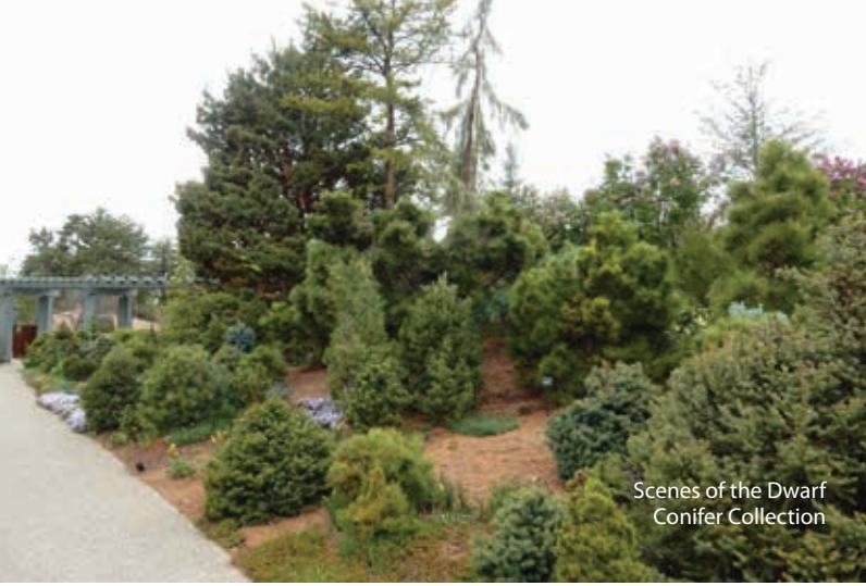
Scenes of the Dwarf Conifer Collection