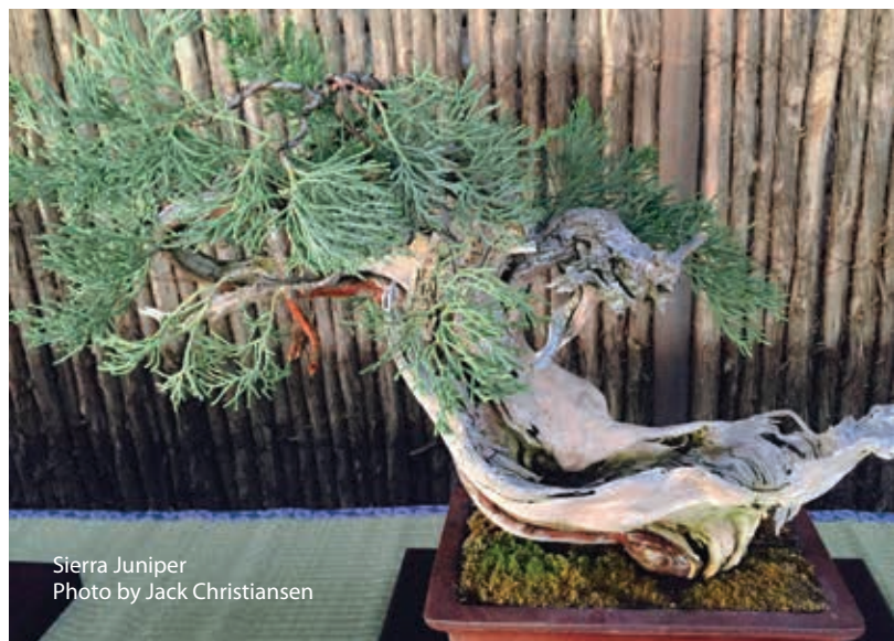
Sierra Juniper

The bonsai beginner is advised to do some reading and to talk with active bonsai enthusiasts to gain an understanding of the basic requirements for trees to survive when grown in containers. Then, acquire some plant material, more than a tree or two, in which one doesn't have too much invested emotionally and monetarily—plants which don't have to survive—and experiment.