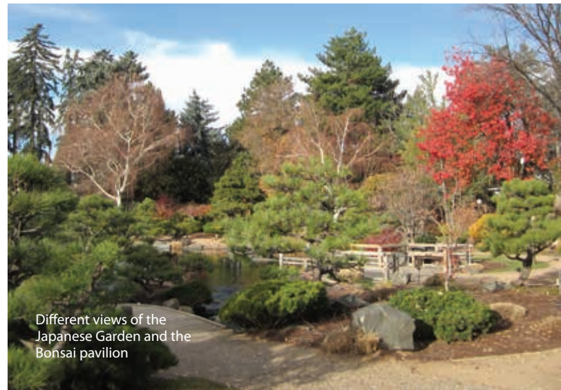
Different views of the Japanese Garden and the Bonsai pavilion