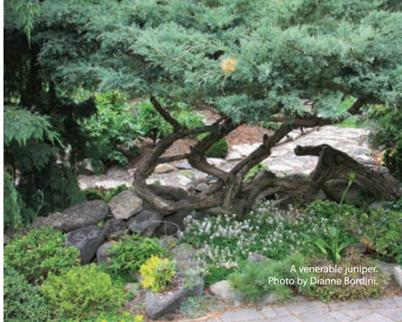
A venerable juniper.