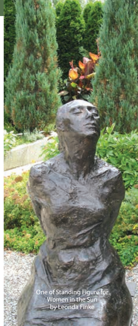
One of Standing Figure for Women in the Sun by Leonda Finke

New Jersey is known as “The Garden State”. That nickname came to be on August 24, 1876 when Abraham Browning of Camden made the declaration on New Jersey Day at, of all places, the Philadelphia Centennial exhibition.