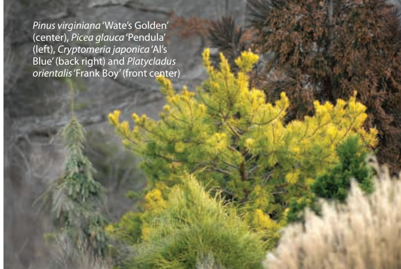
Pinus virginiana 'Wate's Golden' (center), Picea glauca 'Pendula' (left), Cryptomeria japonica 'AI's Blue' (back right) and Platycladus orientalis 'Frank Boy' (front center)

I began collecting conifers in 2013. I have since planted hundreds in my front yard. Since I have plenty of space, I have been buying larger and larger plants recently, but I'm still a sucker for the interesting young plants, typically grown by Iseli Nursery, which you find in pint-sized containers at local nurseries.