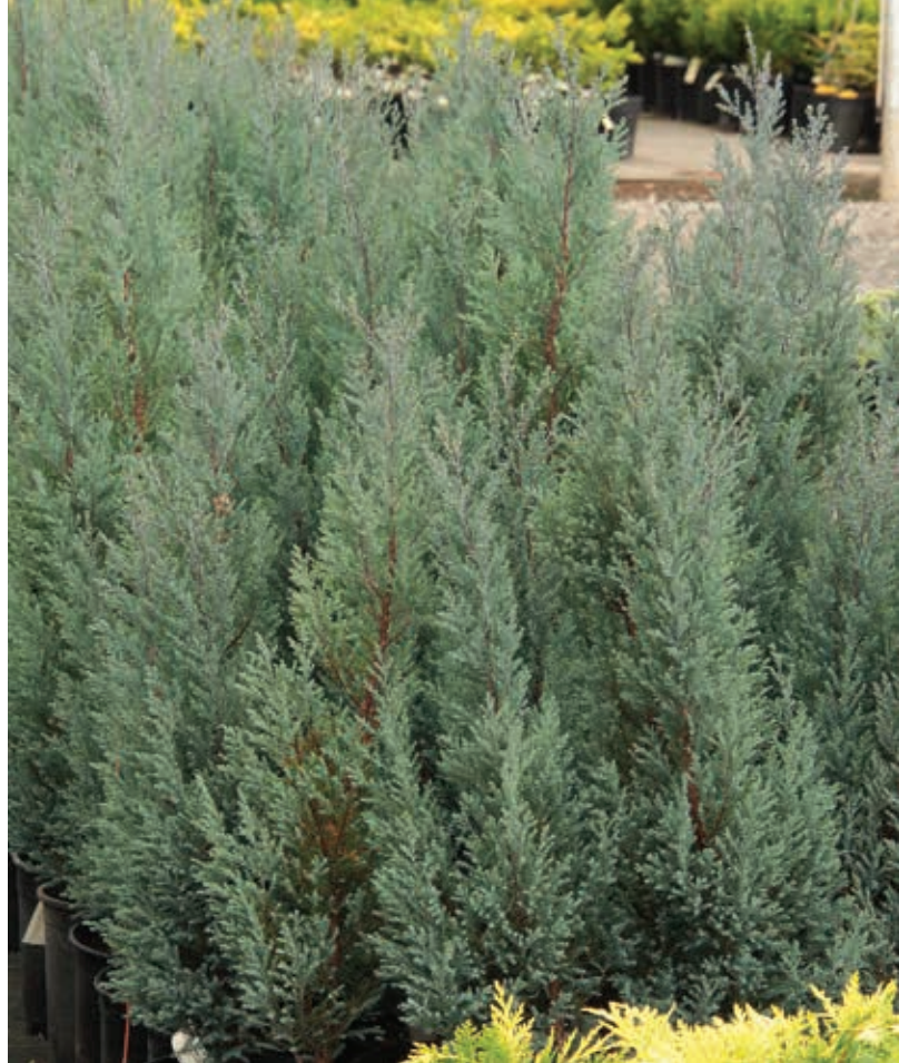
Chamaecyparis lawsoniana 'Blue Surprise'.

and the US Forest Service searched out and developed disease-resistant varieties which are now used as rootstock in grafting susceptible ornamental varieties.