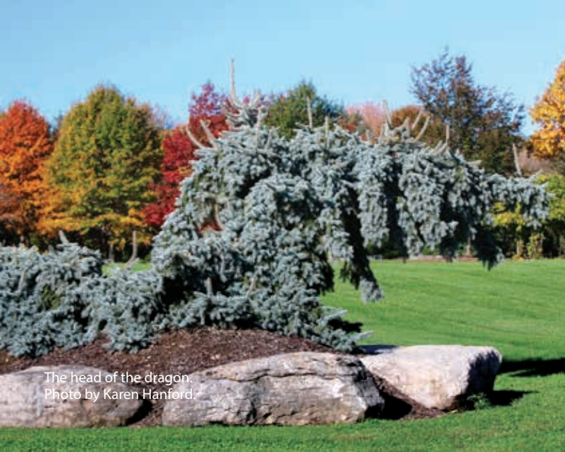
The head of the dragon.