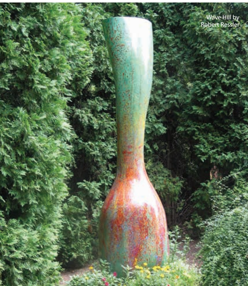
Wave Hill