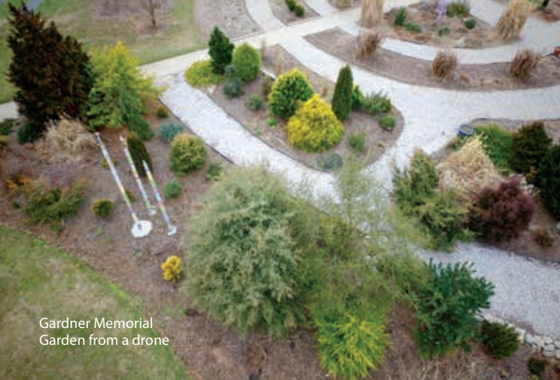
Gardner Memorial Garden from a drone