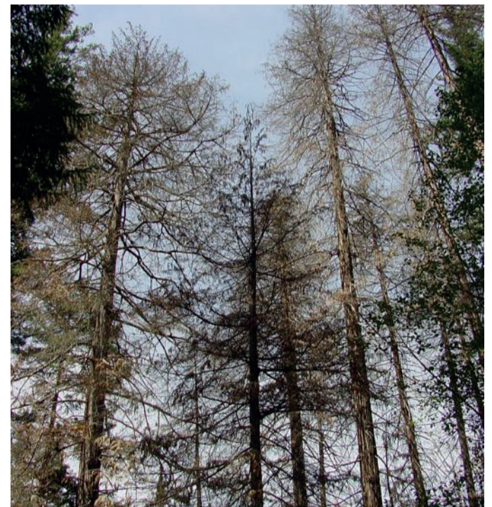
Lawson's Cypress killed by Phytophthora lateralis (Roseburg, Oregon).