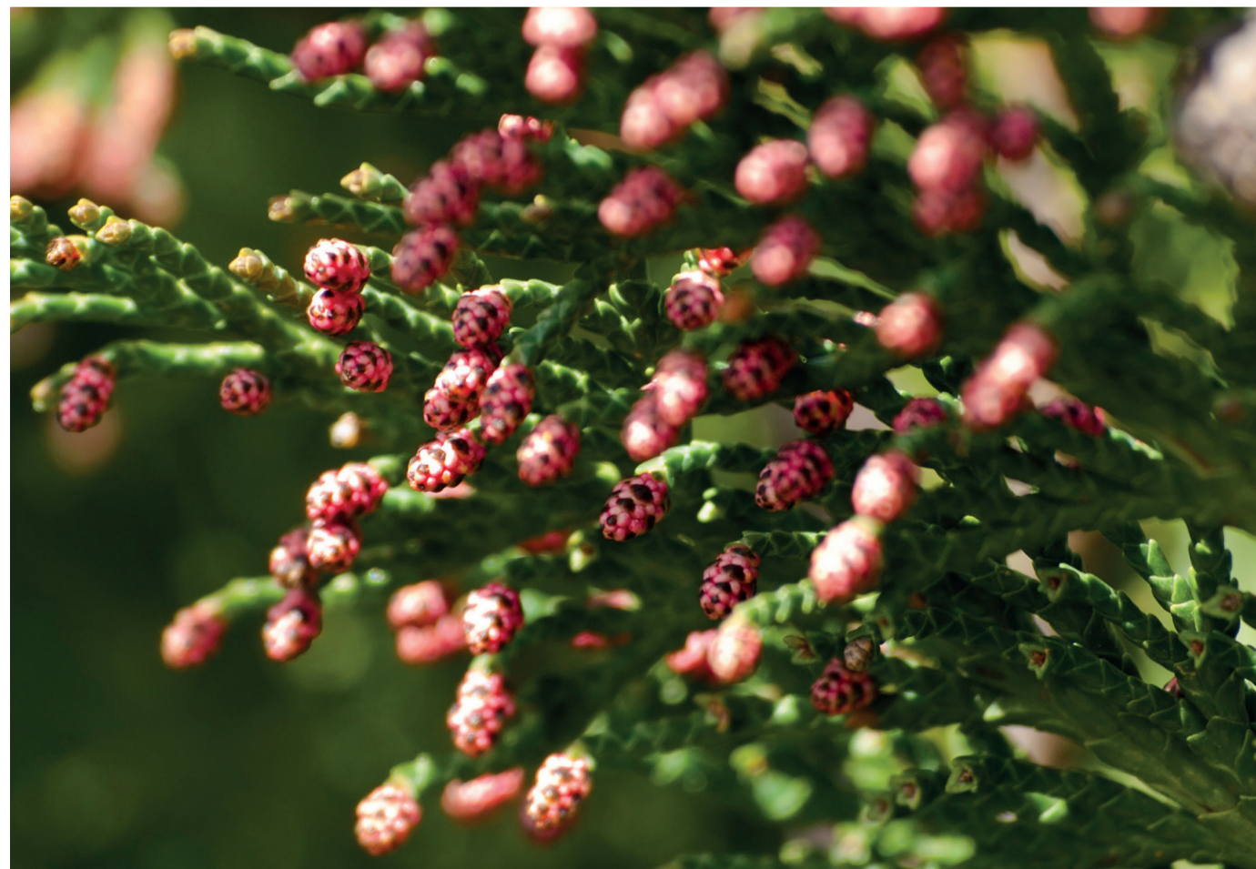
Map 1: Plot distribution and simplified chorology map for Chamaecyparis lawsoniana . Frequency of Chamaecyparis lawsoniana occurrences within the field observations as reported by the National Forest Inventories.

Lawson cypress prefers medium-textured soils with consistent summer moisture, but it can also grow in drier conditions. It is relatively shade-tolerant and can cope with a wide range of conditions and soil types. It is able to grow either under a forest canopy or as a pioneer in the open. Growth rate is relatively slow for young trees, but older trees retain their ability to respond to more light and space and can become dominant in old-growth forests. It is usually found in mixed coniferous forests (fir, spruce, pine), or with broadleaved species such as oak 11 . It is an interesting species ecologically as its natural range is extremely small, yet it is able to survive in a wide variety of conditions 4, 12 .