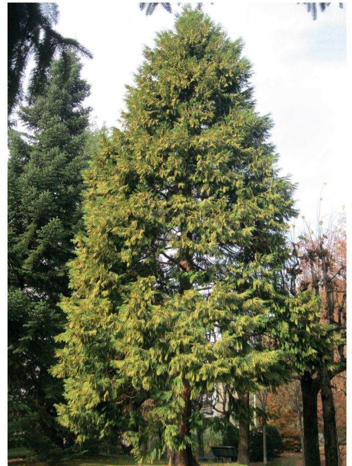
Ornamental specimen in a park in Varese (North Italy).

Lawson cypress is highly susceptible to the oomycete Phytophthora lateralis that has spread throughout much of its range, causing heavy losses since first being described in 1923 1 . The pathogen causes root rot and can quickly kill trees of all ages. This has resulted in Lawson cypress now being classed as “near threatened” in the United States. The pathogen has more recently been observed in Europe where it now poses an increasing threat 16, 17 .