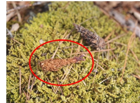
Pine cone eaten by flying squirrels.