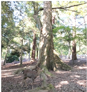
Deer in Nara Park

1 Stoutest in the Park! Japanese Black Pine ( Pinus thunbergii )