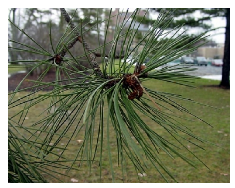
Pinus nigra - Leaves