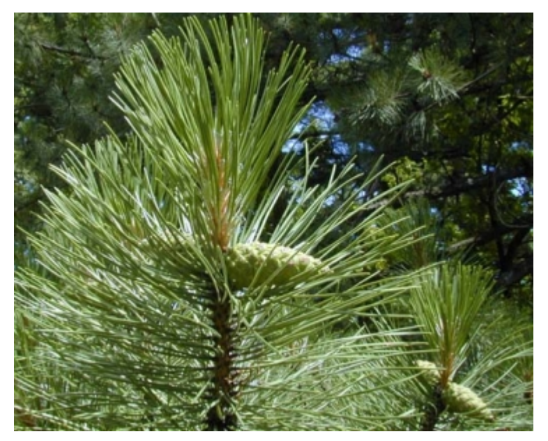
Pinus nigra - Cones