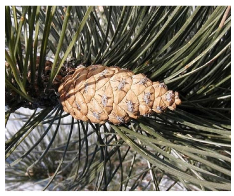
Pinus nigra - Cone