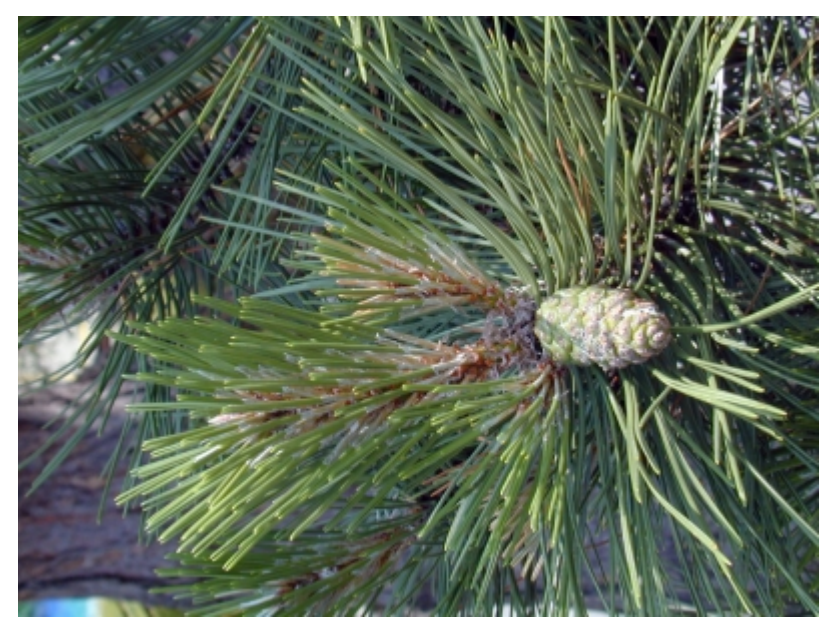
Pinus nigra - Leaves