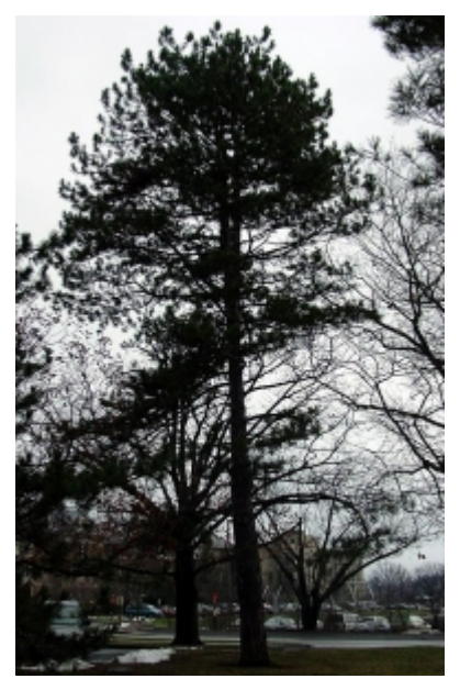
Pinus nigra - Habit