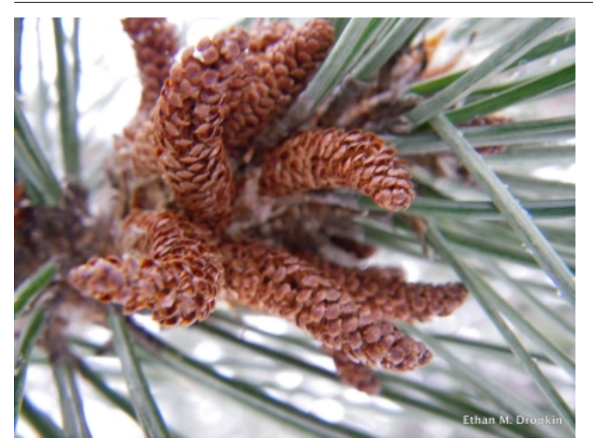
Pinus nigra - Cones