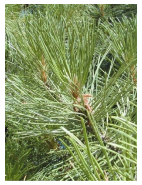
Pinus nigra - Leaves