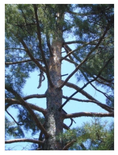
Pinus resinosa - Bark