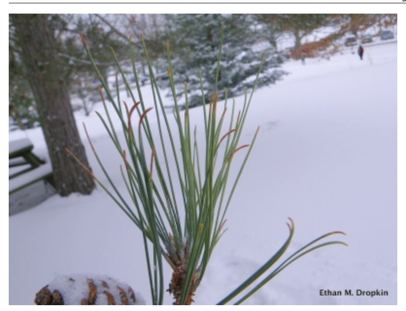
Pinus resinosa - Leaves