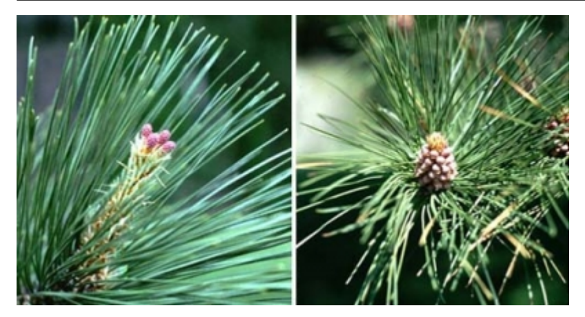
Pinus resinosa - Cones