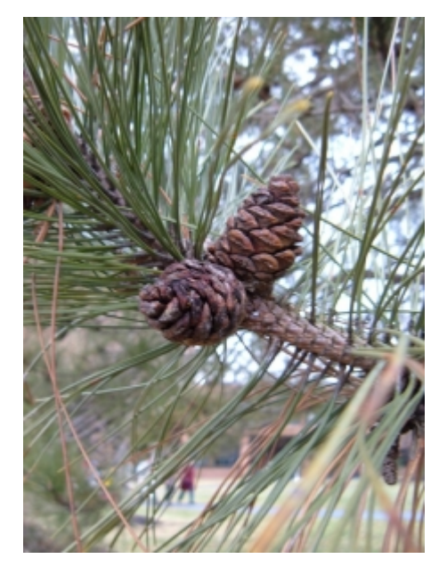
Pinus resinosa - Cones