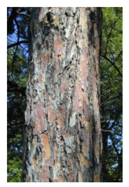
Pinus resinosa - Bark