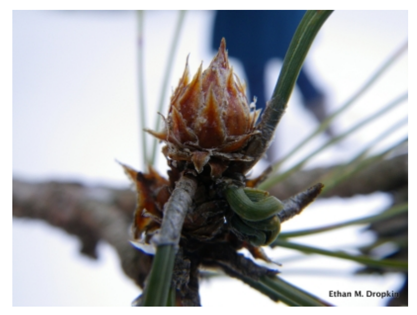
Pinus resinosa - Buds