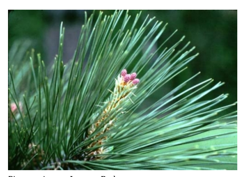
Pinus resinosa - Leaves, Buds