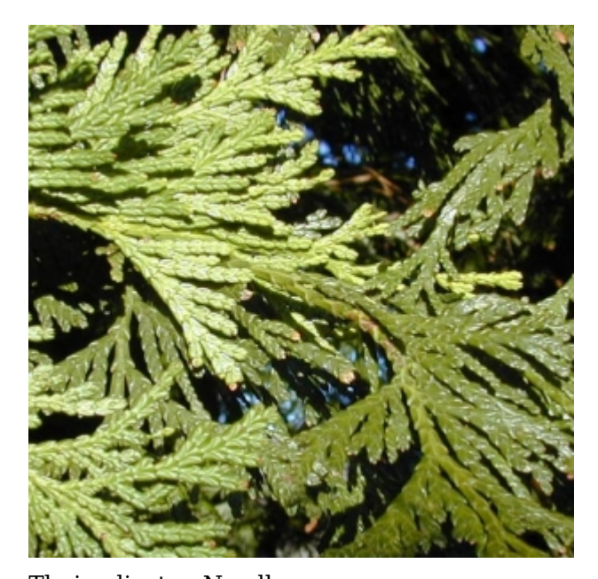
Thuja plicata - Needles