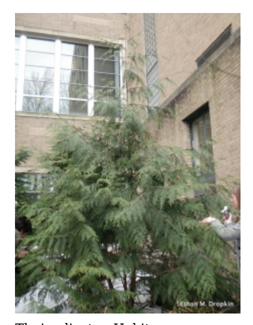
Thuja plicata - Habit