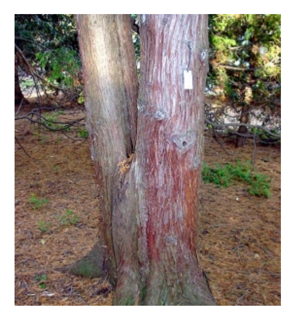
Thuja plicata - Bark