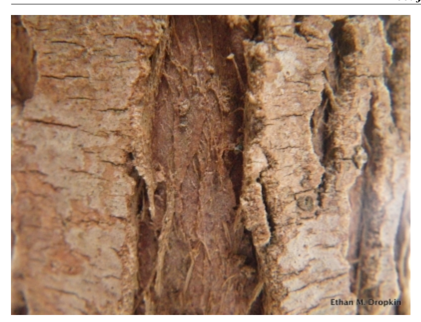
Thuja plicata - Bark