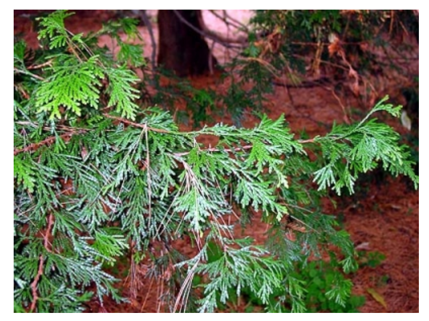
Thuja plicata - Leaves