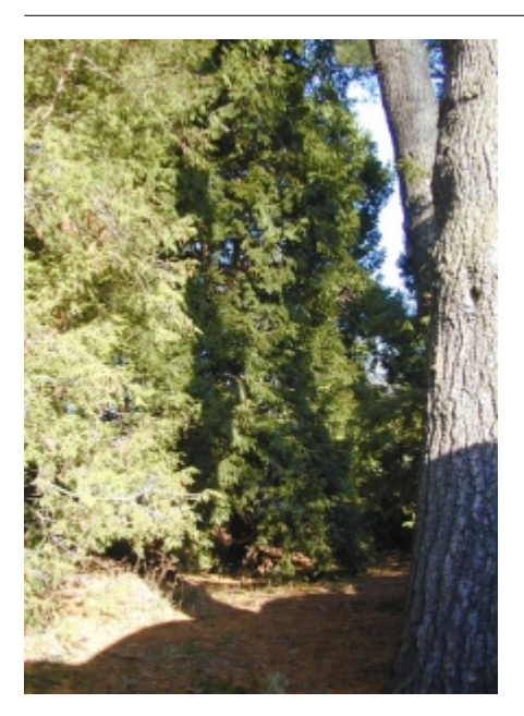
Thuja plicata - Habit