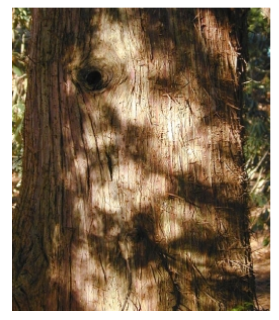
Thuja plicata - Bark