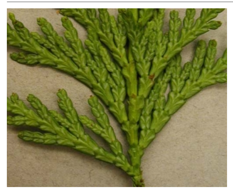
Thuja plicata - Leaves