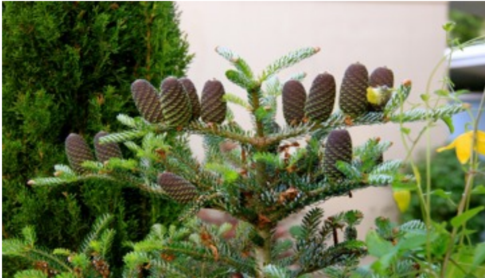
Abies koreana 'Silberlocke' showing cones

3) Abies koreana 'Silberlocke'. This German selection is a standard. 'Silver Show' is a brighter blue and more dwarf. For something on an even smaller scale there is 'Icebreaker' that originated as a witch's broom on 'Silberlocke' in Germany.