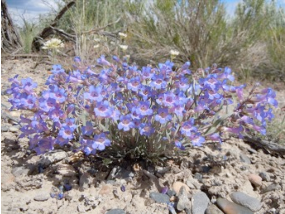
Penstemon pumilus

Following Alan in his seed collecting footsteps, we then moved on to the White Mountains of California and then swung north to the Siskiyou Mountains where we saw rarities such as Campanula shetleri and Silene hookeri ssp. bolanderi . Carrying on further north, we travelled into the Owyhee Mountains of Idaho and specific plants on Diamond Peak, Borah Peak and Dickey Peak. Outstanding flora in this area included diminutive Penstemon pumilus and cushions of Phlox bryoides .