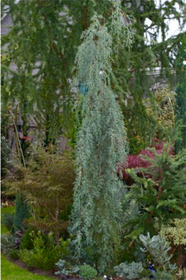
Cupressus glabra 'Raywood's Weeping'