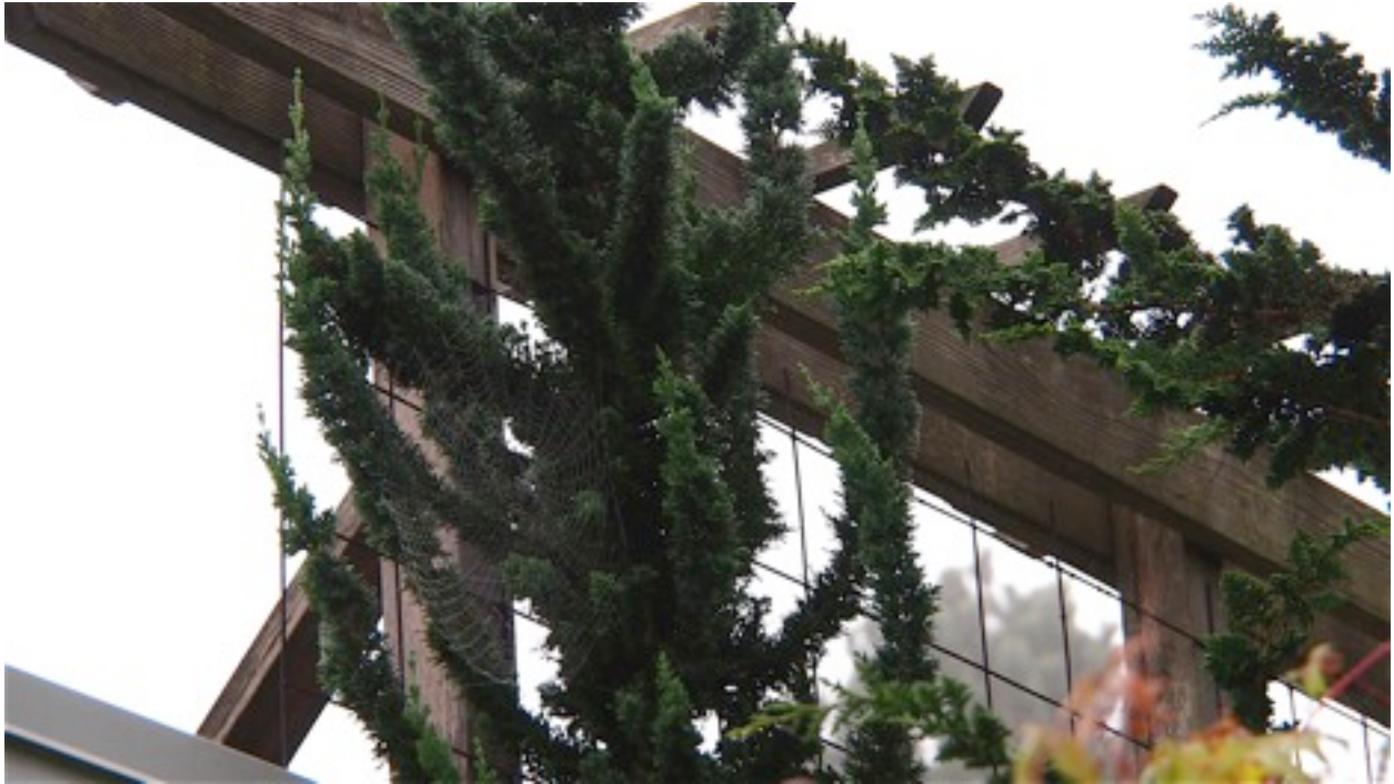
Chamaecyparis lawsoniana 'Wissel's Saguaro'

Chamaecyparis lawsoniana 'Wissel's Saguaro'- these gangly imitators of the Saguaro cactus become tall and slim and look fantastic planted in groves. My largest is 12 feet tall and 1 foot wide! They're great for narrow walkways. Dramatic and beautiful, their arms just cry out for a hug- thankfully they aren't as prickly as their namesakes!