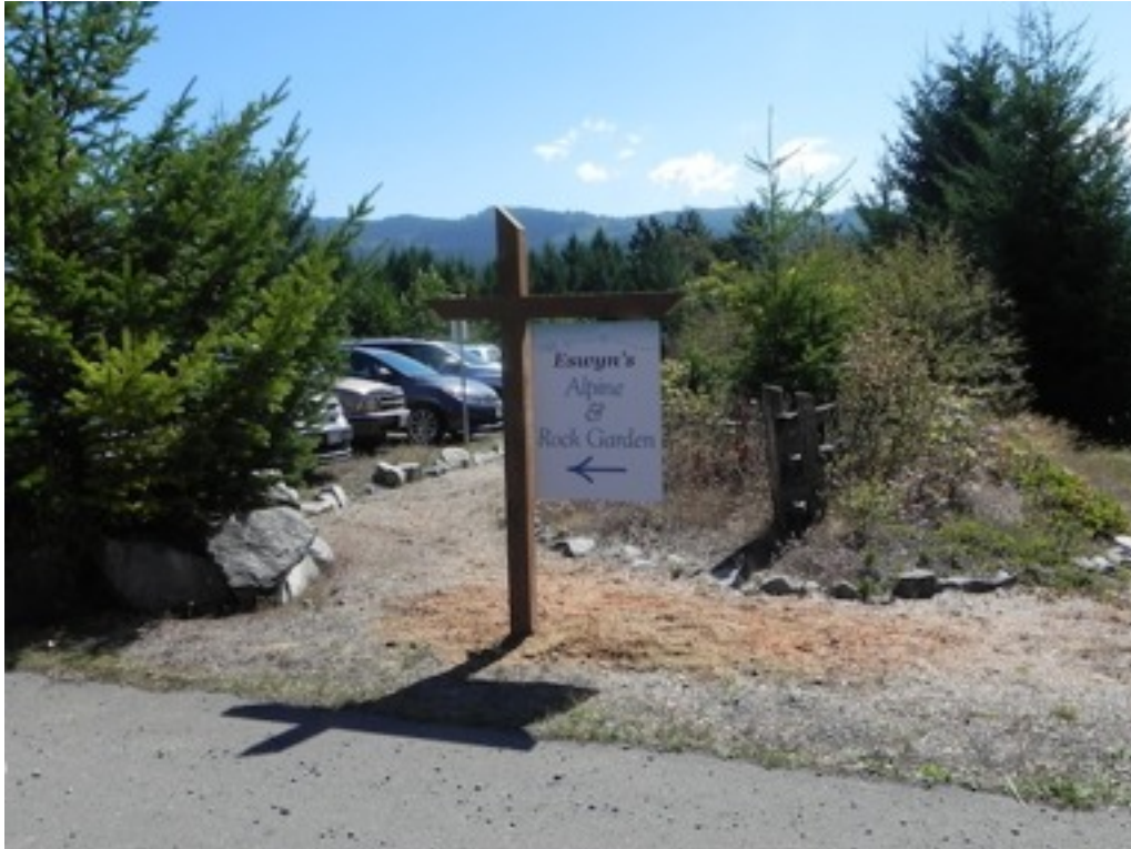
Eswyn's Alpine & Rock Garden in Nanoose

And speaking of firsts and new, I must say how pleased I am to report the formation of a new rock garden club here on Vancouver Island- The Alpine Gardeners of Central Vancouver Island . Based in Qualicum Beach/Parksville, they have been active the past few years as the Alpine Study Group of the Qualicum Beach Garden Club. At the heart of the club is Eswyn's Alpine & Rock Garden in Nanoose, created initially with alpine plants from the garden of club founder, the late Eswyn Lyster.