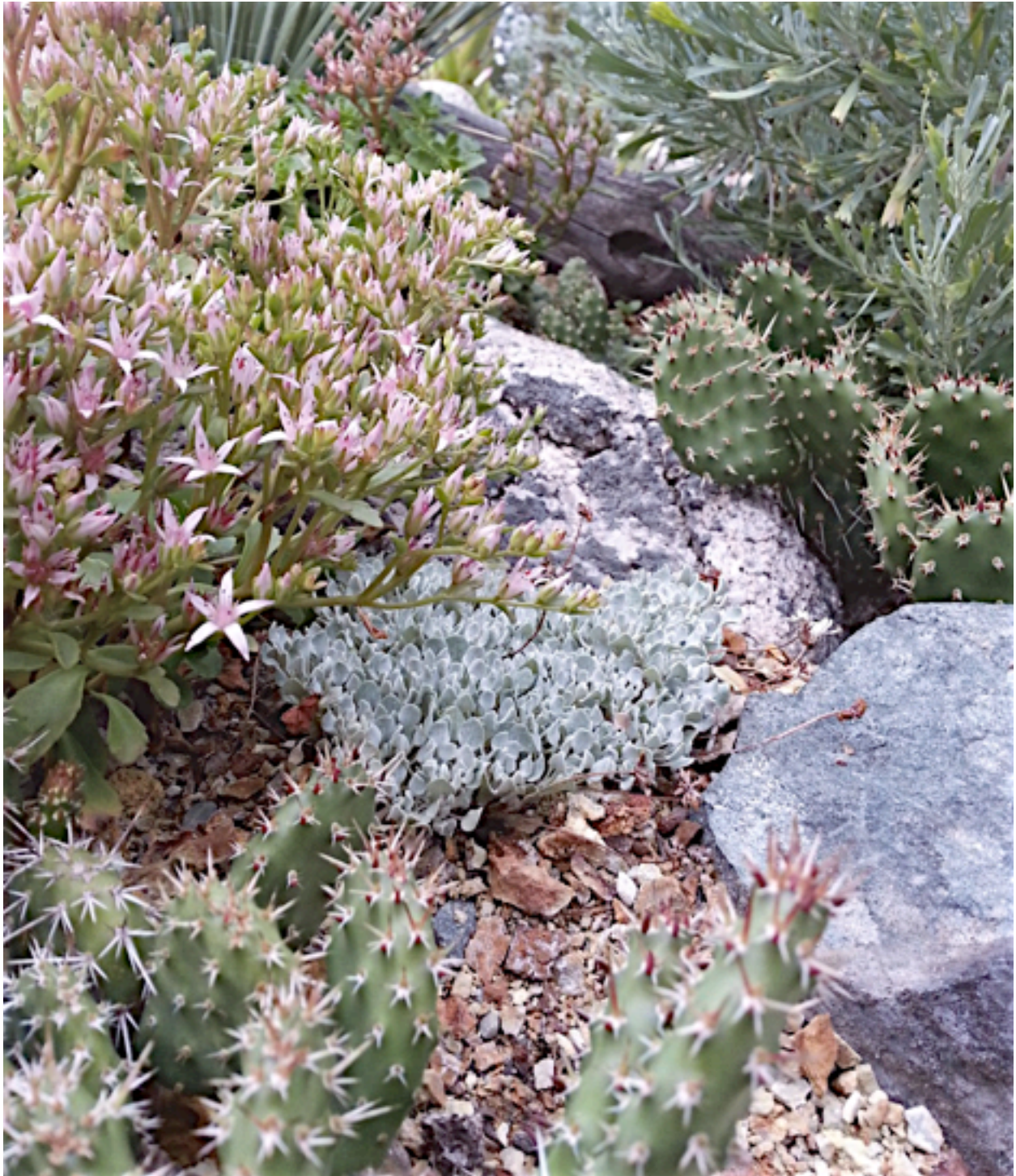
Eriogonum kennedyi , centre with (clockwise from bottom left) Opuntia 'Claude Arno', Sedum spurium , Artemisia tridentata v. vaseyana and an Opuntia aurea hybrid.