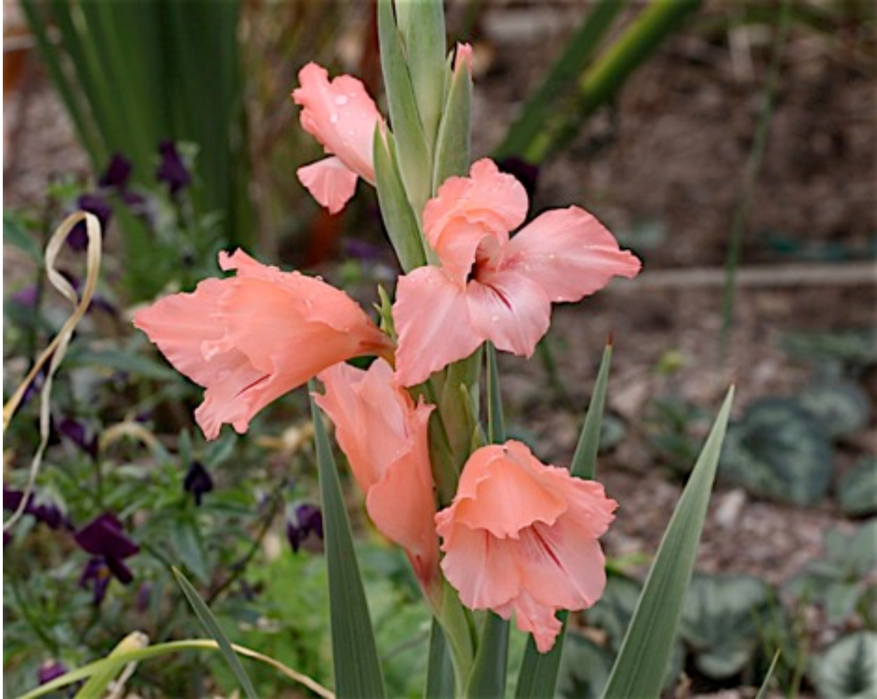
Gladiolus oppositifolius 'short form'

The flowers lasted nearly a week before shrivelling up - only to be replaced by just as many new ones. The whole plant by now was less than 12" tall and, as you can see, pretty stunning too! Eat your heart out Gladiolus flanaganii - I may have a new favourite! I had suspected what I'd bought as Gladiolus oppositifolius ssp salmoneus would be 'one for the garden' when sowing this amongst a dozen or so other species from Silverhill Seeds several years ago. And, of course, I planted it there with that in mind ...So, c'mon now, where's all my other surprises waiting to shoot up?