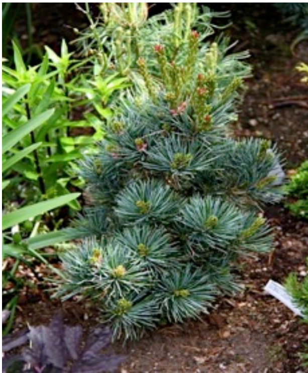
Pinus parviflora 'Aoi'

2) Pinus parviflora - the Japanese white pine is one of my favourite species and I have several individuals. 'Aoi' is a particular stunner and a tiny perfect Christmas tree. Aoi means blue in Japanese. This species needs light to look its best.