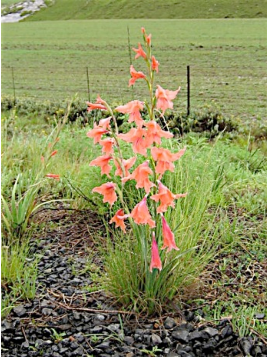
Gladiolus oppositifolius 'short form' seen in situ in the E. Cape. Note the rocks and very well-drained soil.

Far Reaches Farm lists this as a wild-collected seed product (Silverhill) getting 18" and Zone 7A hardy, they reckon. www.farreachesfarm.com/Gladiolus-oppositifolius-ssp-salmoneus-p/p1469.htm