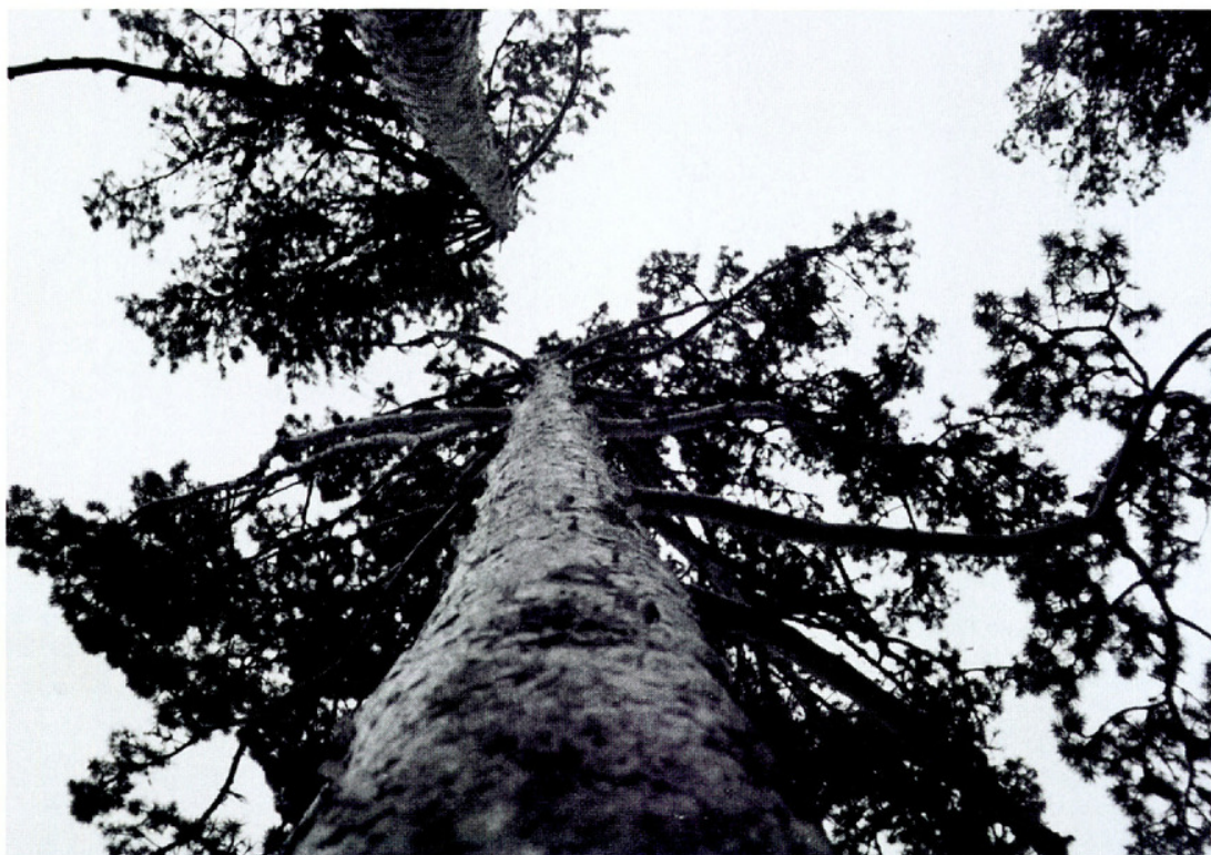
FIG 2. Pinus sylvestris L. var. manguiensis .

TYPE: CHINA. NEIMONGGU: Mangui, 26 Jun 1986, S. Y. Li 861-917 (HOLOTYPE: NEFI!).