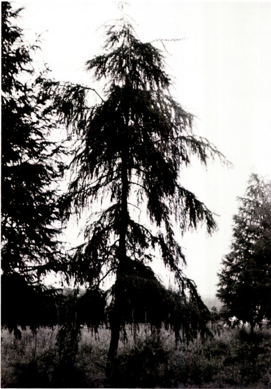
FIG. 1. Larix gmelini (Rupr.) Rupr. var. genbensis .

slopes. It has withstood temperatures of -45^{\circ}\text{C} . This larch should receive horticultural attention because of pendulous branching and cold tolerance.