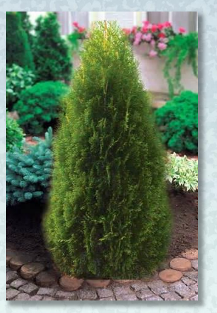
EMERALD GREEN CEDAR Thuja occidentalis 'Smaragd' / Semi-dwarf cedar with a narrow, symmetrical, pyramidal habit, and glossy, bright green foliage in flat, lacy sprays.