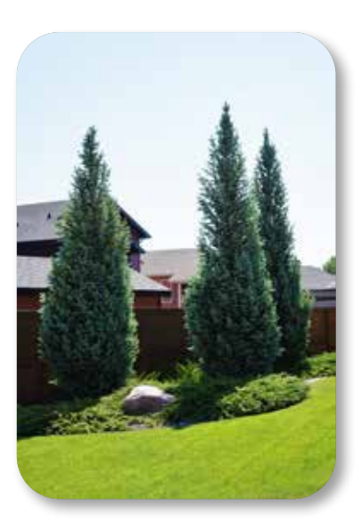
Columnar Blue Spruce