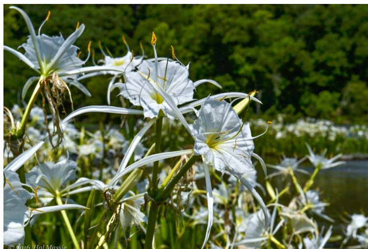
Hymenocallis coronaria at Big Lazer WMA

Other rare plants that we may see during the 2018 Pilgrimage include fringed campion ( Silene catesbaei ), turkeybeard ( Xerophyllum asphodeloides ), showy skullcap ( Scutellaria pseudoserrata ); Pyramid magnolia ( Magnolia pyramidata ), and bigpod wild indigo ( Baptisia megacarpa ).