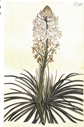
Xerophyllum asphodeloides Illustration by Sydenham Edwards